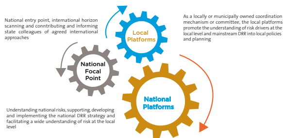
FIGURE 2 Role of National focal point, national platform and local platform

A national focal point for DRR is defined as a national governmental body and entry point responsible for the implementation, review and reporting of the Sendai Framework through the Sendai Monitor and is most usually the national disaster management agency or civil protection agency. The focal point is supported by the national platform for DRR. The Sendai Framework focal point is generally responsible for the national DRR strategy, including national risk and capability assessments, and national DRR reviews and reporting.