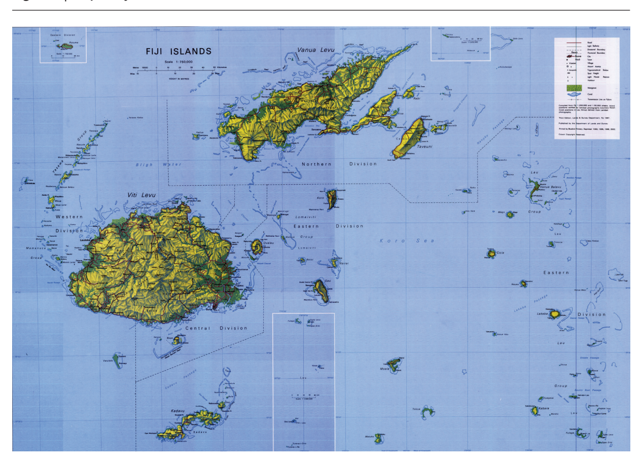
Figure 1 | Map of Fiji Islands

Fiji's economy was projected to grow by 3% in 2020, but instead contracted by 19 percent due to the global coronavirus pandemic, which forced Fiji to close its borders to international tourists from March 22, 2020 to December 1, 2021 (International Monetary Fund, 2021). Tourism accounts for 38% of government revenues and a significant portion of Fiji's domestic climate finance revenues (Reserve Bank of Fiji 2020). As of publication, more than 90% of Fijians were fully vaccinated and the country had reopened its international borders to travel partner countries. Beyond tourism, Fiji's main economic sectors are community and personal services (21.2%)