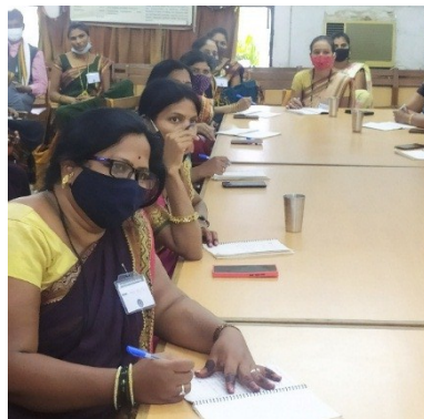
Economic infrastructure – beyond roads and buildings – for women's enterprise in social sector needs tremendous investments, sustained and substantial, shows recent assessment by AIDMI.

Report, 2019-20). Social norms prevent women from accessing mentorship and training. In 2018-19, 4.9% of women received informal business training, vs. 12.9% men 4 (PLFS, 2018-19). During the lockdown, only 9% of women respondents learned a new skill 5 (IWWAGE, 2020).