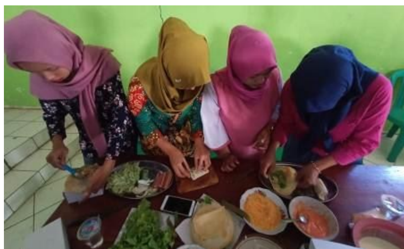
Illustration of the PKK's Cooking Workshop: Snack Making Workshop by the PKK members in Sukodadi Village, Semarang City, Central Java Province. (Ref.: Sukodadi Village Government. 2019 [cited 2022 Jan 22]. Available from.

The Ministry of Health initiated Active Villages Preparedness in 2006 to improve health quality in villages across Indonesia for a better quality of life. The program focuses on improving health services and developing community-based health surveillance, emergency and disaster management, and environmental health (7). Other than village-based health practitioners, cadres,