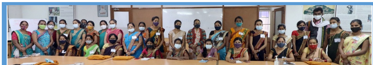
We do very little about the impact of COVID-19 in women's economic enterprise – activity to organisation – even though the impact is negative and huge, indicates initial assessment by AIDMI .