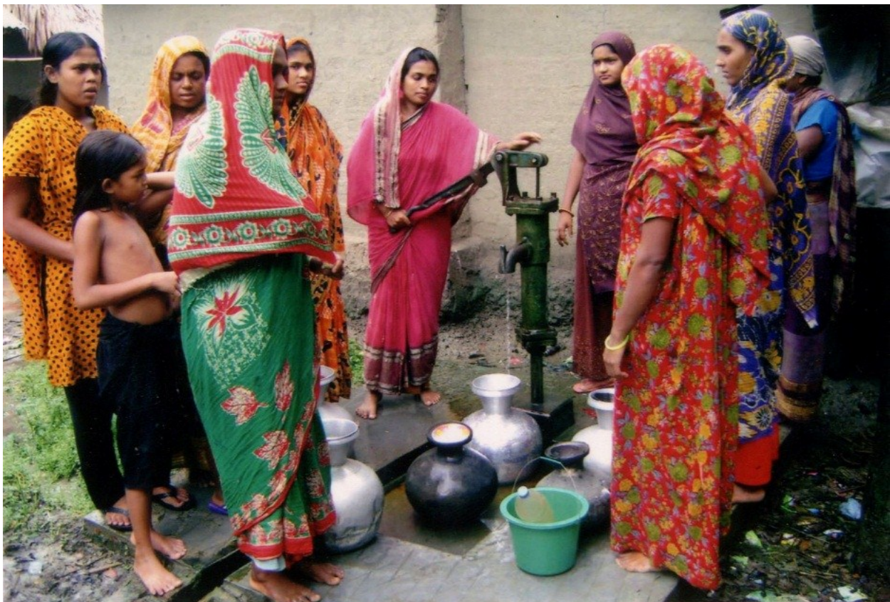
Women in WASH resilience.

Since, low levels of awareness and poor understanding of climate change risks, combined with significant knowledge gaps about climate change processes, have hindered effective societal decision making, there is a need to initiate massive campaign to challenge the social norms around unpaid care work, women's leadership, and gender-based violence, with special focus on WASH sector and sanitation value chain. ■