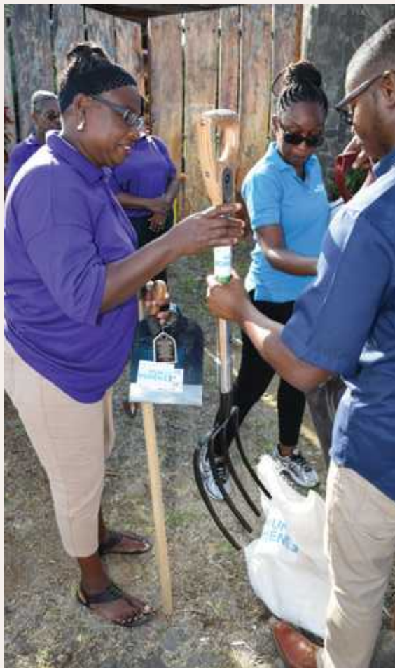
UN Women providing equipment to women farmers, Dominica.

In September 2017, Category 5 Hurricane Maria battered the small island nation of Dominica. Less than six months after, UN Women coordinated a Post Disaster Needs Assessment (PDNA) to assess the impact of the Hurricane on smallholder women farmers in the western and southern districts of the island. 76 per cent of smallholder women farmers reported major losses, with their crops wiped out, equipment and tools destroyed. Many women farmers in the country were already at a disadvantage in the agricultural sector since prices for their crops were set for them by the traders. Post-Hurricane Maria, UN Women is currently supporting women farmers' groups to jump start production by facilitat-