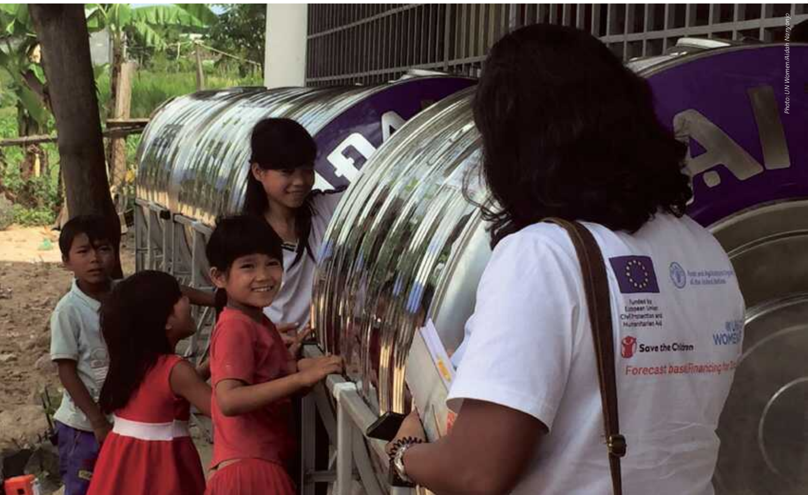
Distribution of water tank as one of early action identified by women and men in Gia Lai province before the drought season.

To leverage expertise and strengthen buy-in and reach for gender-responsive DRR and resilience, UN Women partnered with 16 UN agencies including UNICEF, UNDRR, UNDP, FAO and UNFPA, 56 CSOs and NGOs including women's organisations, 2 private sector companies, 3 academic entities, and 20 other entities such as national level line ministries, totaling altogether 97 partners in 31 operational country contexts.