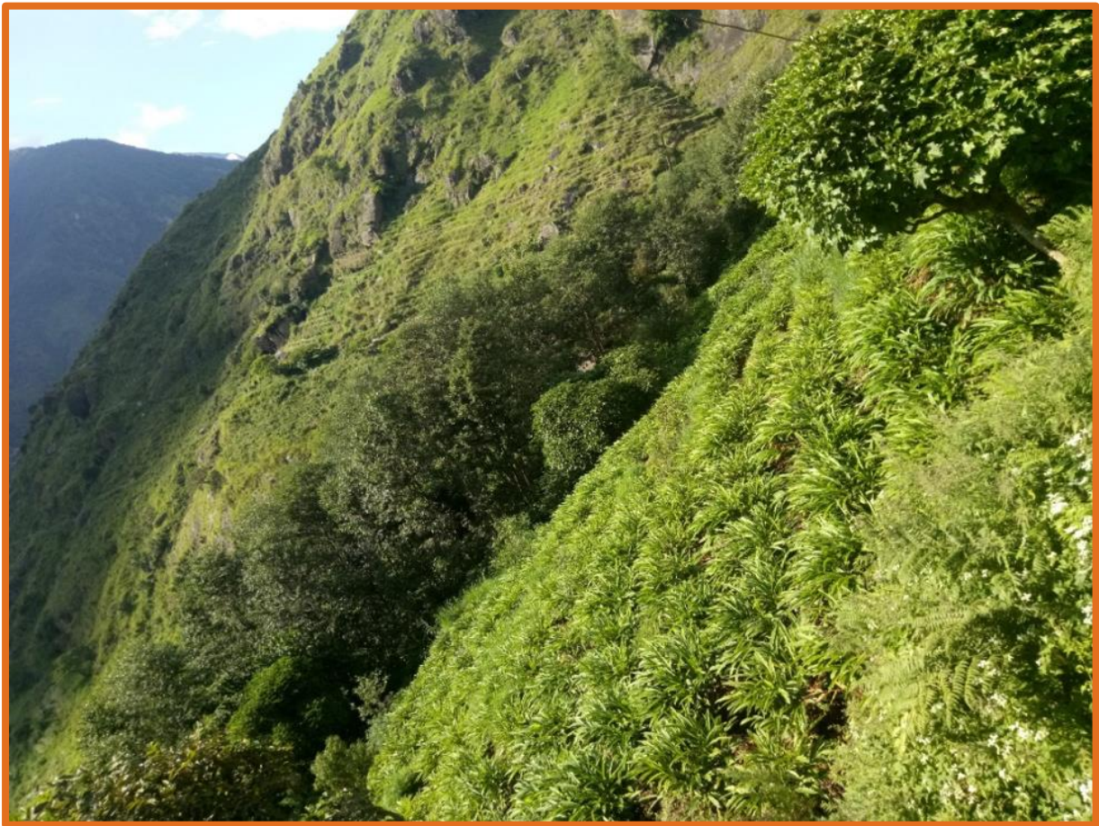
Cardamom farming in Sanjapu Village, Nepal

https://www.wwfnepal.org/hariyobanprogram/