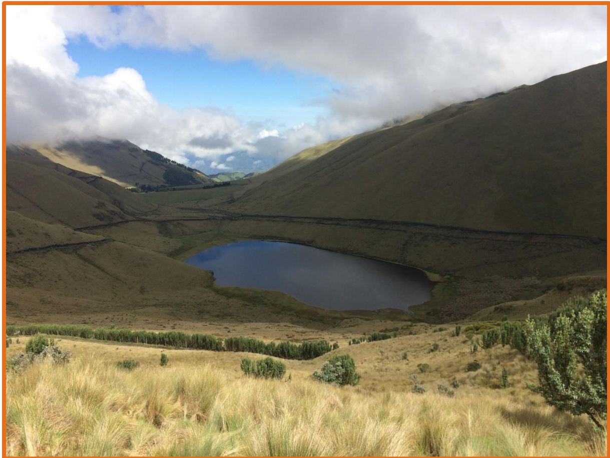
A small lake in the Ecuadorian páramos