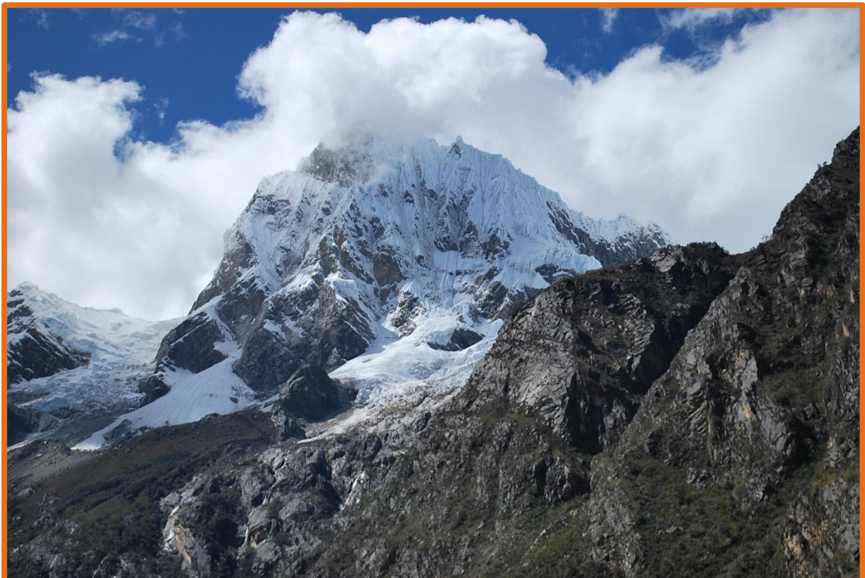
The Andes Mountains in Peru