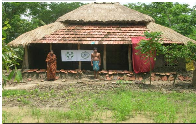
A finished house belonging to a family.