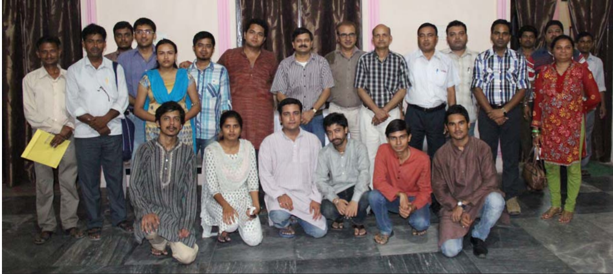
Hazard mapping team in Bihar, June 2013.

A ddressing hazards and vulnerability in local disaster management planning is not a new area. What is new is the rapidly changing socio-economic context in which hazard and vulnerability assessment takes place and the process of disaster management planning. The ongoing review of key 22 District Disaster Management Plans (DDMP) across India shows the following concerns: