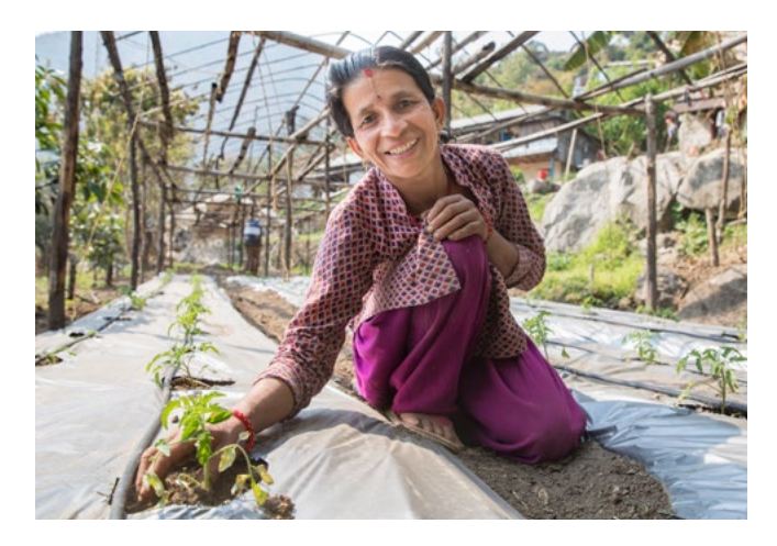
A woman from Kavrepalanchowk District in Nepal works in her garden. She and her husband, pictured together on the cover, participated in the household dialogue in their community.

In M-RED program areas in Nepal, there were clear instances where participation in the household dialogue increased men's trust in women, particularly such that it would allow women to leave their homes to participate in community groups. For example, a BRIGE supervisor explained that among two couples, the men discovered that their wives were going to trainings and were upset. They thought trainings were a place where the women would go to flirt or become "morally corrupt." Toward the end of household dialogue, however, they were accepting of women going to the trainings. With these same two couples, a business plan was developed to help them promote the agricultural products that the women learned about at the trainings. Moreover, in addition to increasing men's trust of women's participation in community groups and activities, men's increased trust meant that women gained more mobility in general. In a BRIGE community, participants said, "When women used