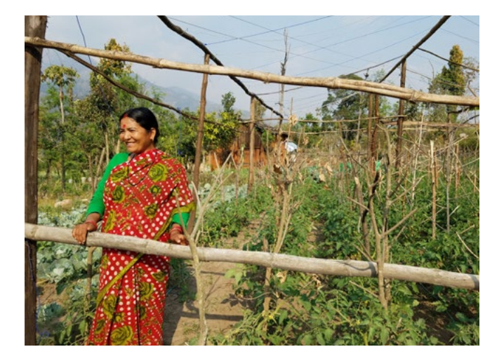
A household dialogue participant with her garden in the Far Western Region, Nepal.

In the ERP areas in Nepal, women from mixed-caste communities in BRIGE intervention areas who received the full household dialogue curriculum tended to report increased confidence in themselves and from their male family members: "In the past, if there were men and women in a meeting, then people would be suspicious about them. But now, men and women are involved in meetings where women also express their views. The men have also started agreeing with the views shared by women" (women in mixed-caste group in BRIGE intervention community, Ghumthang). Noticeably different, however, are women from Dalit groups who participated in BRIGE: they did not report any considerable change in their self-confidence, and men from the same background agreed with this lack of change. In non-BRIGE areas, women from mixedcaste groups reported increased self-confidence and enjoyed support by men from a similar background,