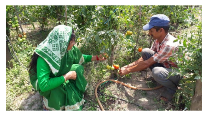
A husband and wife who participated in the household dialogue in Dadeldhura district in Nepal farm tomatoes together.

In ERP program areas in Nepal, men increased respect for women and their opinions because of the household dialogue and the increased exposure that women had to trainings (e.g., in disaster preparedness, financial skills, etc.). As a woman in a BRIGE intervention area said, "Yes, there has been change. Previously, I could not talk in front of people. I also did not know about interest rates, products, and other information relating to the cooperative. Previously I was a member, but now I am involved as a secretary. Now I can conduct any program and also respond to questions confidently" (woman from a mixed-caste group in BRIGE intervention area, Kavrepalanchowk). In Nepal, despite the shift toward increased respect of women's opinions in BRIGE intervention, the key positions in