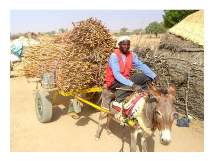
A man in Kania, Niger, helps with household chores by fetching wood.

In LEAP program areas, perhaps due to the cultural context of Niger, the impact of the household dialogue curriculum on shared household chores followed gender lines more strictly, with men directly supporting women with more labor-intensive tasks (e.g., water collection) or paying somebody to help. Very few men engaged in indoor household tasks or supported childcare, as these were perceived to still be within the domain of women's responsibility. Women took advantage of the increased time availability to prepare food with greater care, starting from healthier preparation of food to increased number of meals per day.<sup>31</sup> Women also used the increased free time to attend the Quranic schools that could arguably also strengthen social capital. A woman in Kania said, "Yes, men are more engaged. They perform some household chores. The sensitization campaigns and the messages during the Friday prayer allowed for an