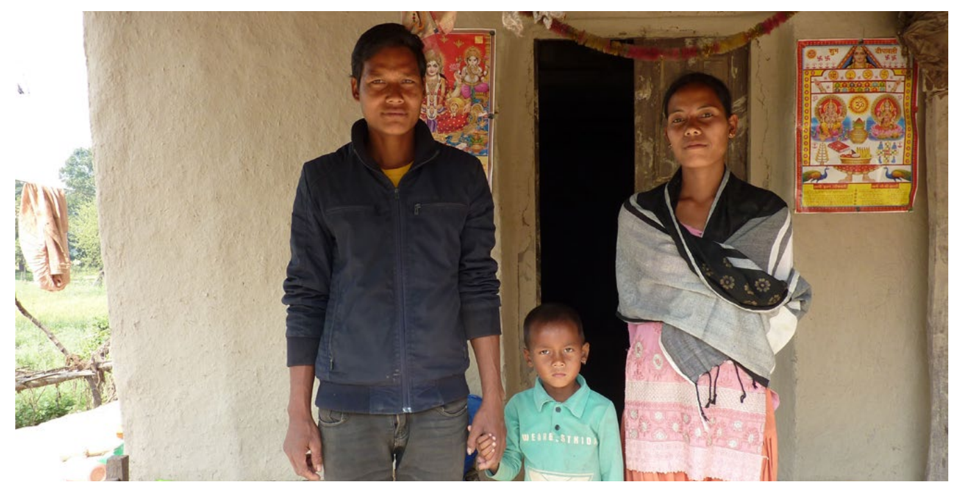
Household dialogue participants from Kailali District, Nepal, with their son.

The Mercy Corps definition of resilience operates at a community-level: "The capacity of communities in complex socio-ecological systems to learn, cope, adapt, and transform in the face of shocks and stresses." Indeed, many resilience programs are organized at the community and systems levels. Overall, the BRIGE research shows that improving women's empowerment at the individual and intra-household levels is an important primer that can, in turn, better catalyze resilient behaviors at both the household and community levels.