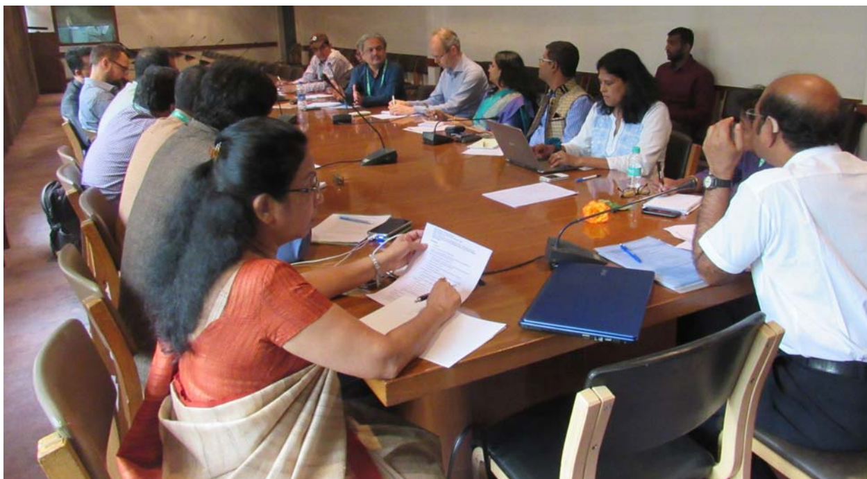
Duryog Nivaran Meeting, New Delhi, Nov. 5, 2016.