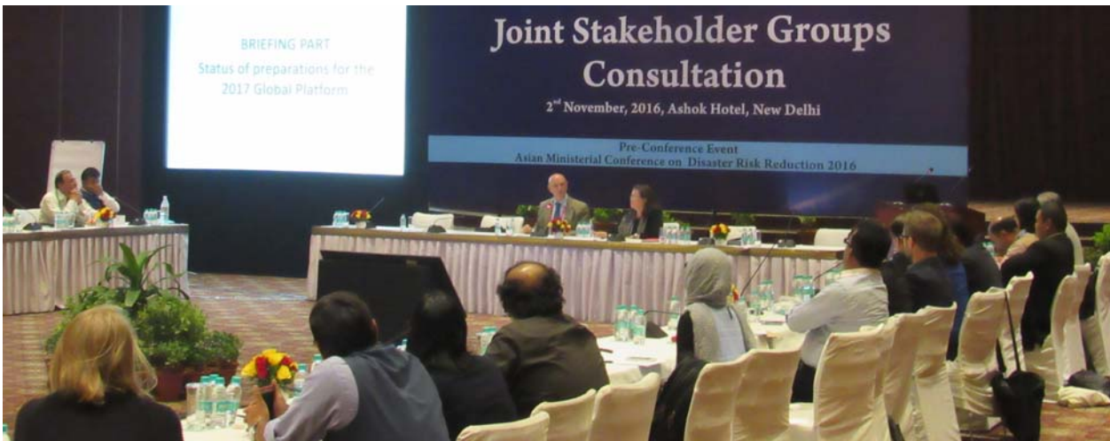
Joint Stakeholder Group Consultation, Hotel Ashoka, Nov. 2, 2016.