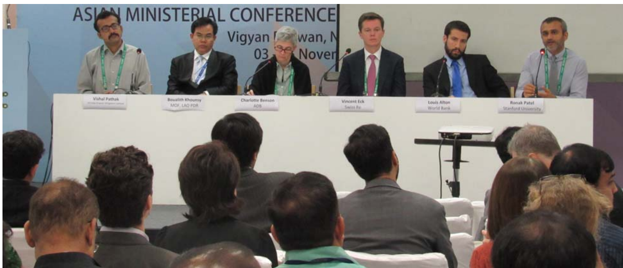
Risk Financing and Insurance, Vigyan Bhavan, New Delhi, Nov. 4, 2016.