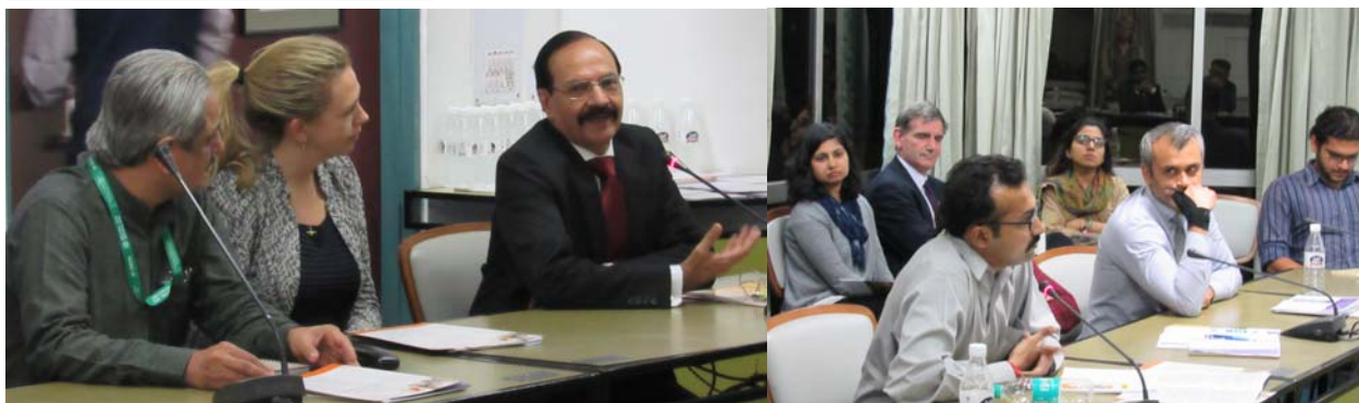
Panel Debate on Building Resilience across Scales, IIC, New Delhi, Nov. 4, 2016.