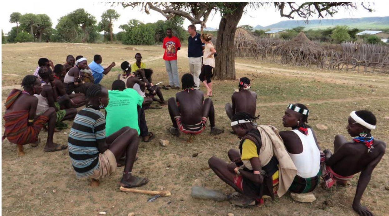
Consulting a community group about a drought resilience programme in South Omo Ethiopia.

One of the significant outcomes of the WHS was the Grand Bargain where 30 large donors and UN agencies, and some other key actors, signed up to 51 commitments across 10 themes to facilitate more flexible, longer-term financing, less burdensome reporting requirements, greater transparency by agencies, more collaborative approaches and reduced overhead costs.