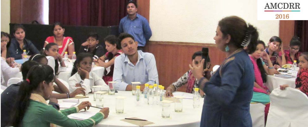
Pre Conference Event on School Safety and Child Centred DRR, Nov. 1, 2016,