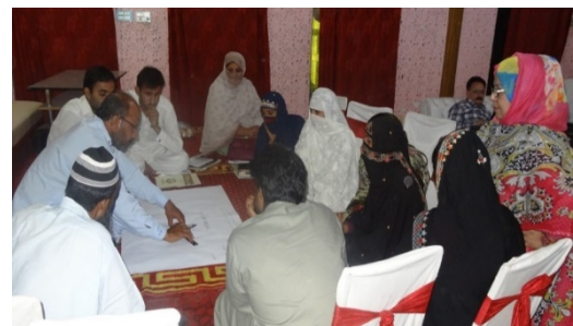
Training in Muzaffargarh, June 2018. Credit: FPAP Youth officer, Mr. Kamran

During the community trainings, participants developed action plans for their respective UCs that aimed to address gaps to implement the MISP for SRH. Communities then spent 1.5 years implementing their action plans to strengthen their capacity to respond to SRH needs in emergencies. Rahnuma-FPAP followed up with trainees every two months; developed information, education, and communication (IEC) materials; mentored trainees; and monitored the implementation of action plans.