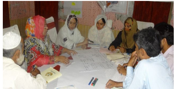
Community session in Muzaffargarh District.

The secret of success of any project is community. If the community follows it, we are successful; people are successful. Representative, Health Department