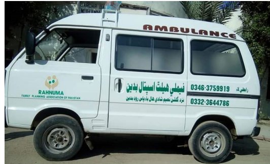
FPAP ambulance, Badin District.