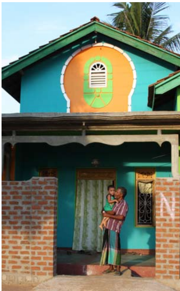
Incremental building is a norm in Sri Lanka, many families built a “500sqft” core house at first, and extended to suit their own aspirations

Under the CRRP, households received a top-up grant for house building to supplement the government’s base grant, a separate grant for water- and sanitation-related expenses, and technical guidance for building. In addition, the project provided a grant for the repair of or improvement to community infrastructure and for facilitating livelihood development.