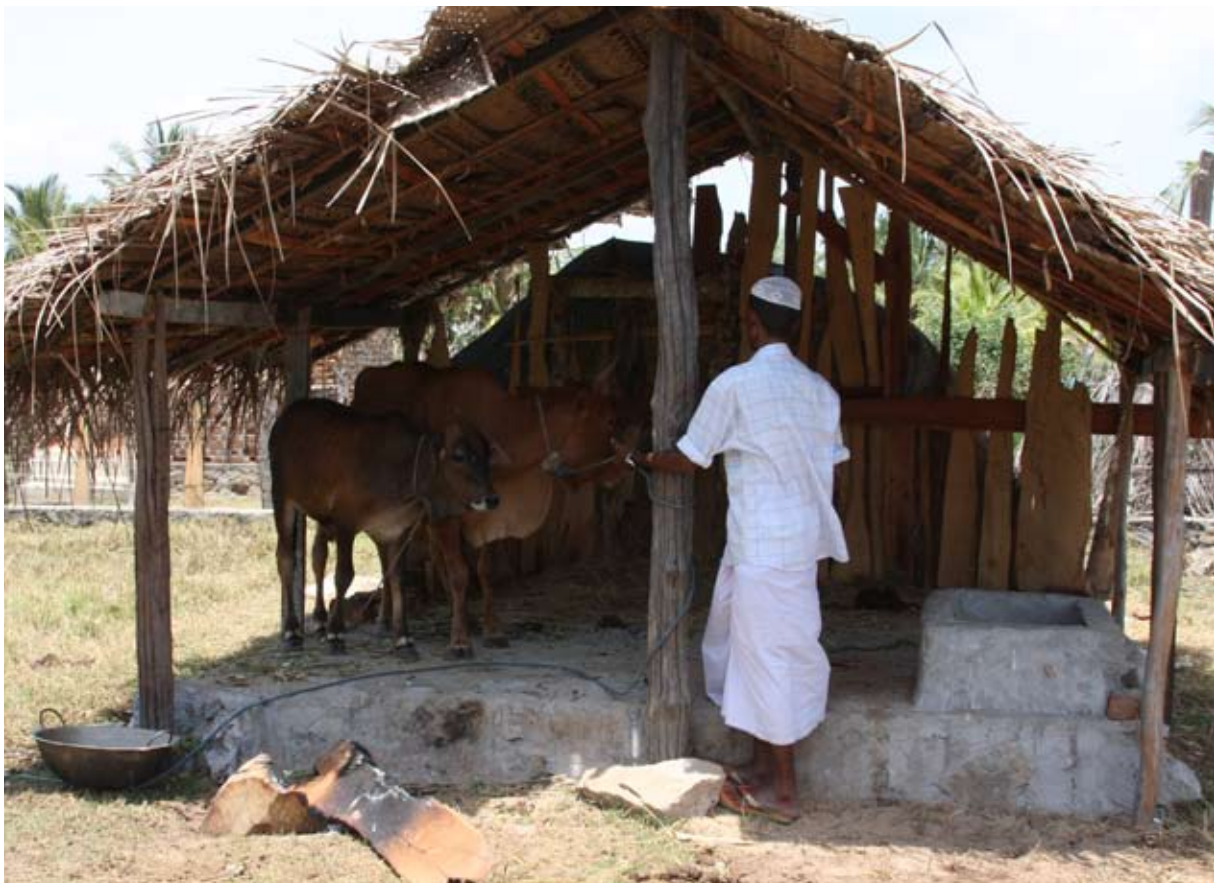
Through partnerships with stakeholders livelihood activities such as cattle farming were promoted

The RCIS project's infrastructure development in the area included drains and culverts in Thirukovil, electricity supply in Vinayagar and a fish stall in Komari.