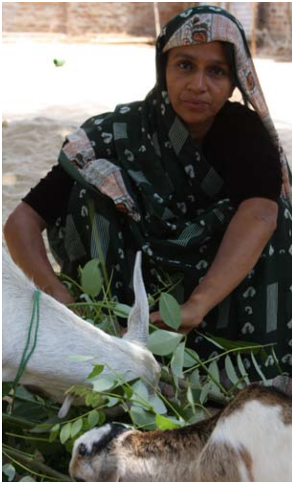
A sustainable Livelihood is a precursor to development: backyard farming and goat rearing is a popular choice

In many areas affected by the tsunami, although people had succeeded in rebuilding their homes, communities still had some way to go to achieve satisfactory infrastructure and livelihoods even five years later. In the Rebuilding Community Infrastructure and Facilities project implemented in collaboration with IFAD, UN-HABITAT's extensive experience in a people's process of reconstruction and recovery was once again put to good use. The project followed the same approach used for the reconstruction of houses: setting up CDCs (where they were none), holding CAP workshops, developing necessary community skills and, as far as possible, building infrastructure through community contracts managed by CDCs.