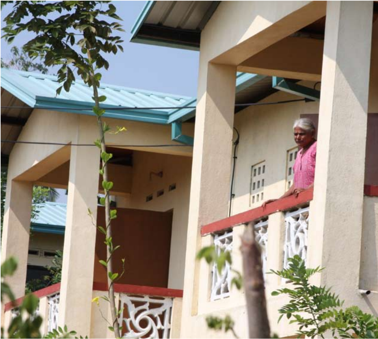
Disaster prepared construction: the 2nd Story provides a refuge against floods in Balapitiya

One of the problems the government had to deal with after the tsunami was the lack of suitable land for resettlement. In the Uddhakandara project the community regularly experienced drought and strong winds, and ‘swelling and shrinking’ of the soil. The project ensured that, from the very beginning, people would be introduced to community-based disaster prevention and mitigation concepts and practices. Each household carefully followed the guidelines for building in high wind- and drought-prone areas published by Sri Lanka Urban Multi-hazard Disaster Mitigation Project. Households were allocated Rs.