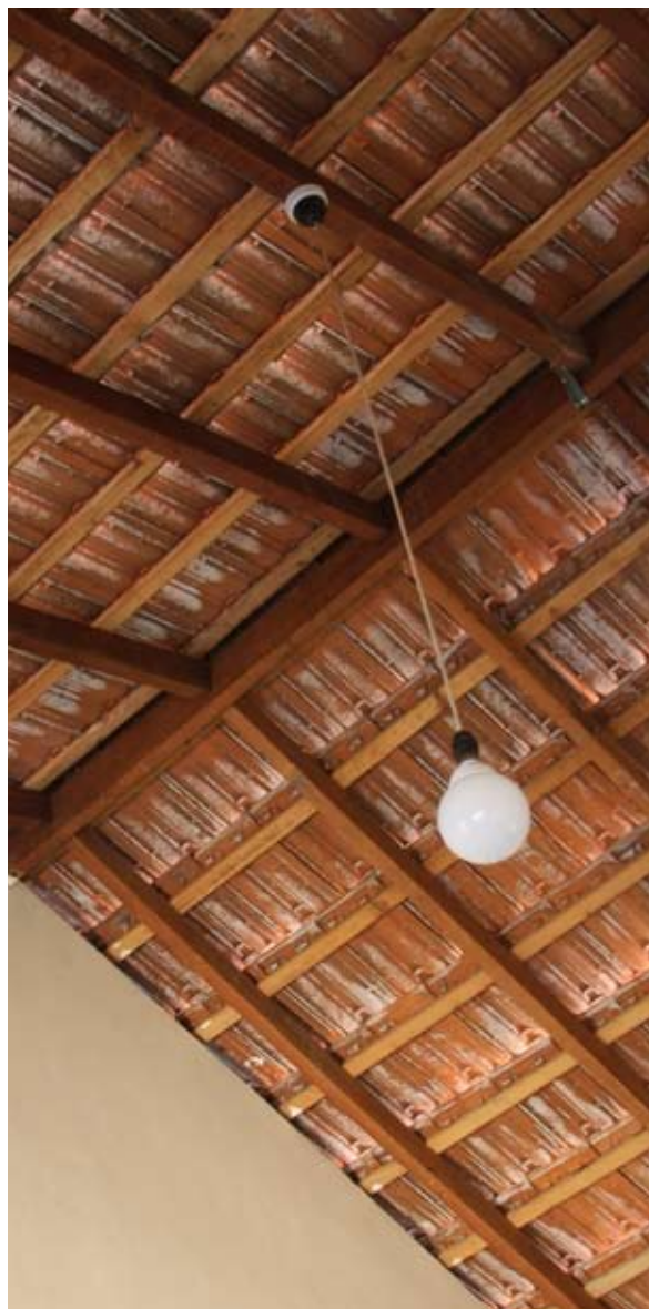
Tiled roofs are not only safer than asbestos, but they also ensure cooler interiors – especially in hot tropical climates such as coastal Sri Lanka

Mr. Chandana, the technical officer, was very particular about every detail. We had to complete something perfectly before going on to the next step. For example, we couldn't fix the doors until the frames were fixed exactly right. Sometimes we found this really frustrating. But we began to understand the value of doing this correctly. The CDCs began to supervise construction closely. Not even a small amount of cement was allowed to go waste. Some people saved money by buying materials in bulk and doing part of the construction themselves.