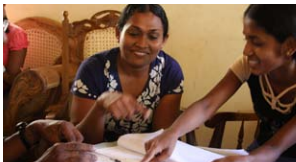
Smiles: ensuring standards results in lasting satisfaction

In Uddhakandara, to facilitate construction work 30 people from the settlement received training in masonry, carpentry, plumbing and electrical wiring. This enabled significant savings on building costs. The project's technical officers worked closely with the householders to finalize house plans as well as guide the entire construction process.