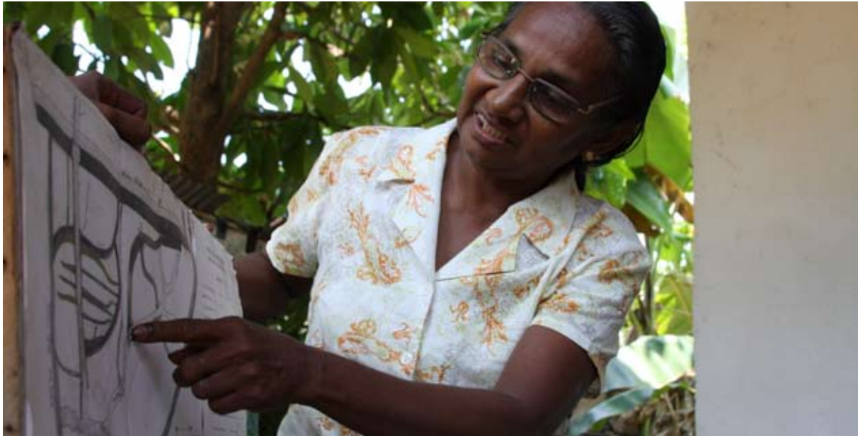
A settlement plan being discussed by the community

In December 2004, UN-HABITAT demonstrated its ability to respond quickly and effectively to a disaster recovery situation. The agency worked with the Sri Lankan government, donors and key stakeholders to assess the tsunami's impact and prioritize areas that were most in need. This was the beginning of UN-HABITAT's involvement in Sri Lanka's post-tsunami reconstruction programme.