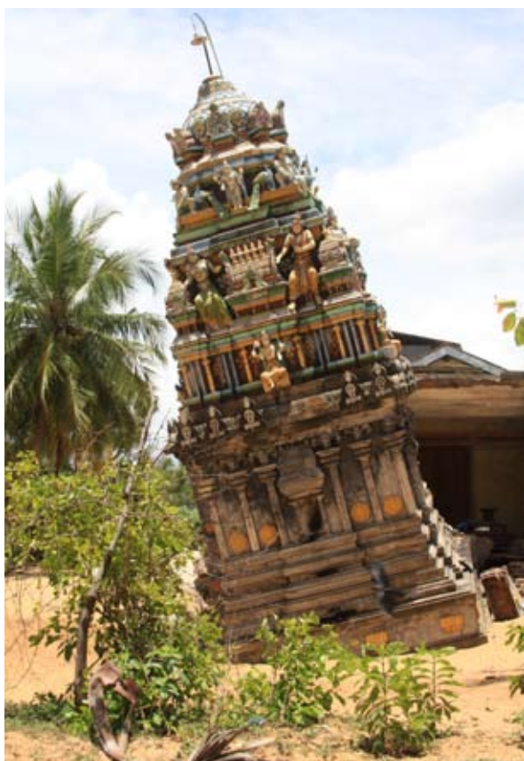
People were forced to rebuild their ways of life: ruins of a Hindu shrine destroyed

avoid winter back home and relax around the magnificent Sri Lankan beaches. When the tsunami struck these tourists were instantly affected and a number were killed. This gave the tsunami an additional international profile and video footage was transmitted around the globe almost instantly.