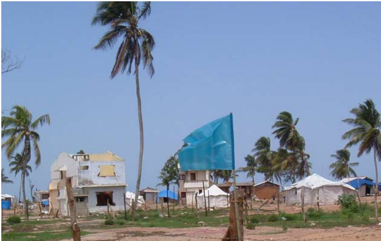
Most devastated houses were in close proximity to the sea, many were affected by the "Buffer Zone" policy

As the title suggests, coordinating hundreds of newly-arrived agencies was an almost insurmountable task. Immediately after the tsunami, UN-HABITAT advocated strongly for an integrated coordination to support the government's effort. While funding for reconstruction projects was plentiful, funding for coordination proved elusive. Although UN-HABITAT provided guidance and support to a