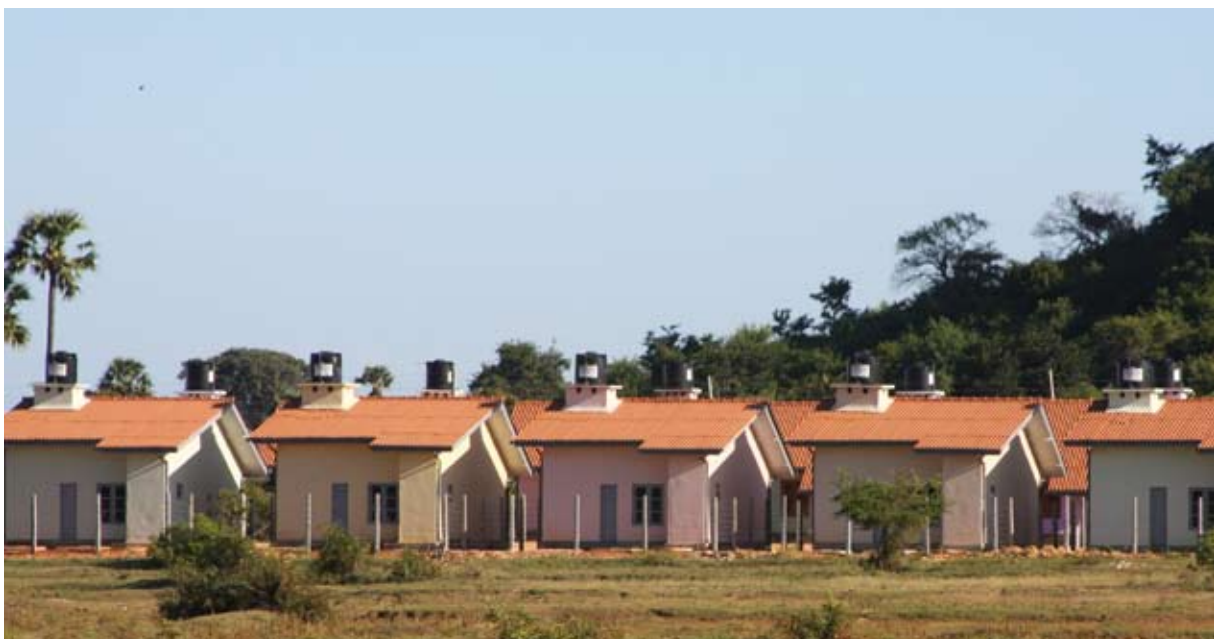
A large donor assisted housing scheme in eastern Sri Lanka

A key lesson learnt by many governments affected by the tsunami was that greater utilization of existing structures and capacity building of ministries such as housing, water and sanitation, urban development, environment and disaster management would be