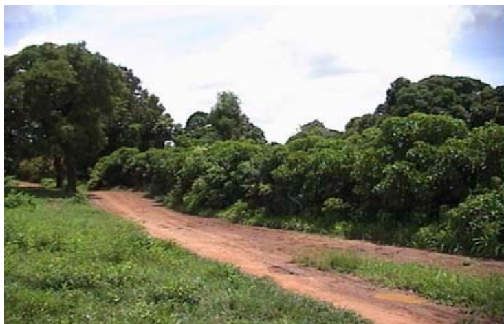
Living Fence

Jatropha curcas is an oil-bearing plant, found throughout much of Mali. It is grown around crop fields and gardens to keep out animals, to act as a windbreak, and to reduce soil erosion by wind and water. Jatropha hedges reduce the degrading effect of the wind and water, as soil collects at the base of the hedges and these accumulations reduce erosion by surface runoff. It is very easy to grow, as a cutting taken from a plant, left to dry for two days, and then simply pushed into the soil, will take root. Jatropha needs only 400 mm of annual rainfall to grow, which means it can flourish even in Sahelian and semi-desert regions. Jatropha is a very fast growing species; plants grown from seed take two years to produce seed, those from cuttings take just one year. This means that Jatropha can be an important weapon in the fight against desertification in the fragile Sahel environment.