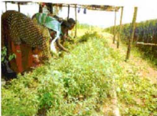
Women potting tree seedlings at Rwenshanku central nursery bed with facilitation from CECOD

Desertification refers not only to the concept of expanding deserts and advancing sand dunes, which has become a more permanent image in the public mind. It also refers to the less invisible and much more serious phenomenon of land degradation and drought in drylands, which requires a double effort and great expense to halt.