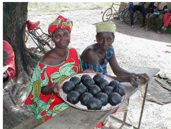
Women selling Jatropha soap

In the project, about 30 ha of Jatropha were planted in abandoned fields and as hedges around gardens and the farmers were trained in different planting techniques. This was done to demonstrate that the Jatropha plant could be used to regenerate degraded land that is no longer suitable for farming, thus serving as a barrier to the advancing desert. In the ten project villages, it was demonstrated that Jatropha can be an efficient tool for combating desertification whilst at the same time bringing economic benefits to women through the three multi-purpose platforms powered by Jatropha oil.