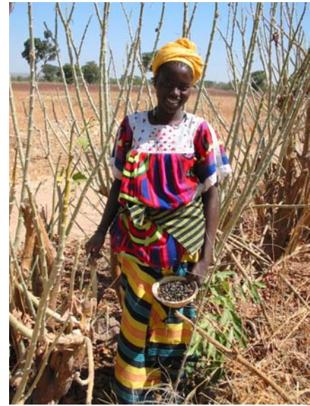
Women collecting Jatropha seeds Arnout van den Broeke

treatments and local soap production. The oil, which can be pressed from the seed, is non-edible. However, this oil can be used as an alternative fuel for diesel engines, due to its similar chemical properties. This is especially important in Mali because of the use of small diesel engines in multi-purpose platforms to provide basic energy services to rural people. The diesel in Mali needs to be imported, and is expensive for rural communities. The precipitate produced as a by-product of mechanical pressing of Jatropha seeds is rich in nitrogen and can be used as a high-quality organic fertiliser, improving the productivity of gardens.