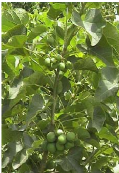
Jatropha plant and fruit

Mali is located in the centre of West Africa on the southern edge of the Sahara, and has an area of 1,241,000 km 2 . Eighty per cent of the 12 million inhabitants live in the southern third of the country, as the northern two thirds of the country is desert, which is advancing every year, threatening farmland and pasture. Ninety-two per cent of all domestic energy used (for cooking and heating) comes from firewood and charcoal and only about one per cent of the population in the rural areas has access to electricity. In rural areas the modern energy sources are mainly fossil fuels (paraffin and diesel). These are used mainly for lighting and providing mechanical power.