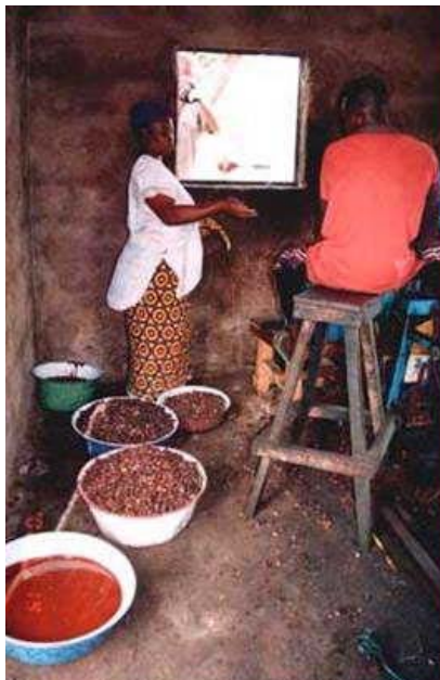
Pressing Karite nuts in platform

The Mali-Folkecenter project, a Malian non-governmental organization (NGO) financed by Siemenpuu Foundation of Finland (2002-2004), investigated and highlighted the different benefits of Jatropha in three regions of Mali (Koulikoro, Sikasso and Kayes). Women were the focus, because they are the key actors in several Jatropha -related activities. Women collect the seeds and sell them to a buyer from outside the community. Women make soap, either from the seeds in a traditional way or better quality soap from the oil itself. They also participate in the planting of Jatropha . Women are also important beneficiaries of the multi-purpose platforms, because the time and energy-consuming work involved in pounding millet, maize etc. is replaced by the mechanical grinding. This considerably reduces the workload of women and leaves time for other activities.