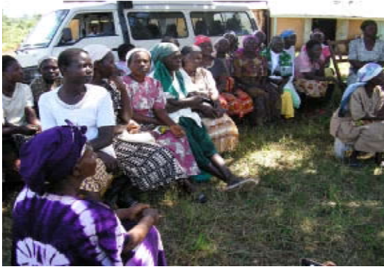
Women from the grassroots women's group, GROOTS Kenya, participating in a Local Dialogue.

Through dialogues, grassroots women have demonstrated their capacity to organize around their own priorities and initiate dialogues with local authorities to improve their access and control over resources and services, as is evidenced by the experience of the UCOBAC (See case study below). For grassroots women, engendering governance is more than electoral politics. It is about changing relations of power by identifying and implementing practical solutions for the everyday priorities of communities.