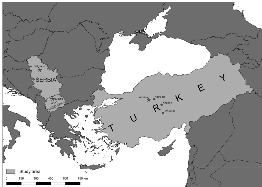
Fig. 1. Study area.

through a predetermined, officially sanctioned procedure. Some research, however, has shown that fears of disaster have a facilitative effect [21] in managing disasters. At the same time, if fears and anxieties are more manageable and moderate (e.g., personalized concern versus terror) and coupled with good, specific guidance from various sources [22,23], people can cope more effectively, as that form of emotional arousal is facilitative rather than obstructive. On the other hand, as mentioned above, some individuals struggle with fear in such a way that they deny the existence of a threat or, alternatively, have fatalistic expectations or other unhelpful coping strategies [12,13]. Risk communication is essential for managing infrequent disasters, as in the recent example Dalrymple et al. [24] noted concerning the Ebola outbreak. Uncertainty derived from a lack of information was later transformed into “a highly fraught environment”, with rumours spreading so that people reported excessive anxiety, fear, and panic.